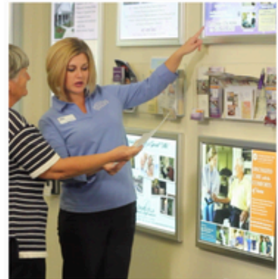
Living Options Showroom