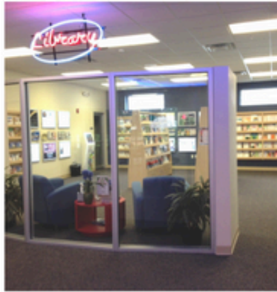
Senior Resource Library