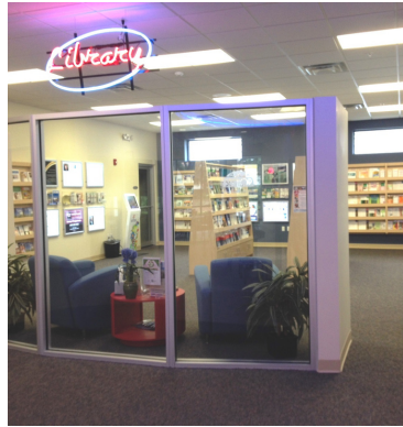
Senior Resource Library