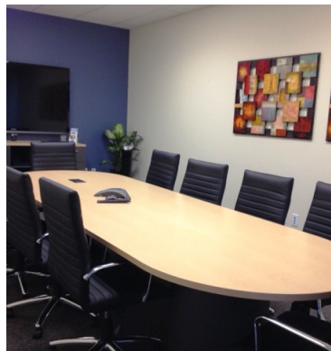
Large and Small Conference Rooms