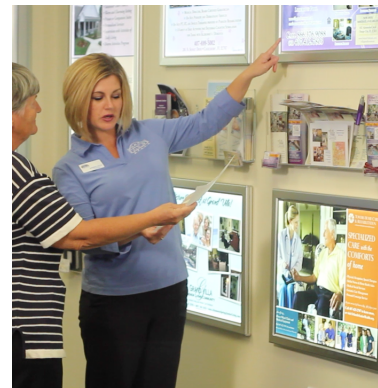
Living Options Showroom